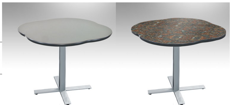
Brainstorm: Foil top