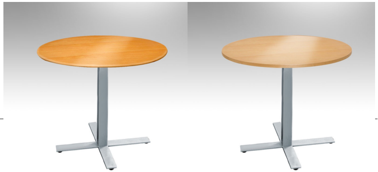
Circle: Foil top