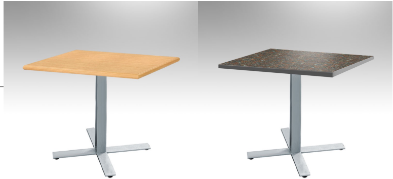
Square: Foil top