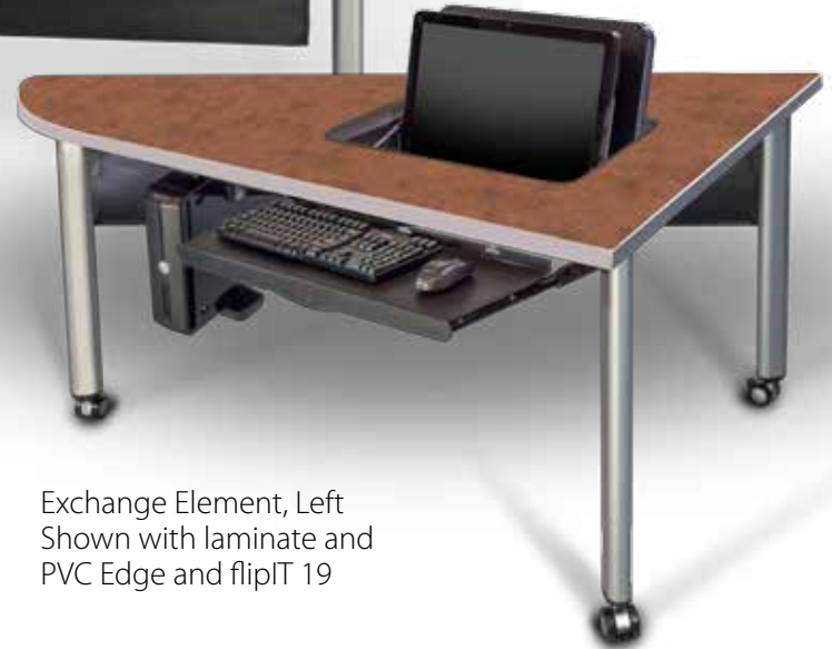
Exchange Element, Left Shown with laminate and PVC Edge and flipIT 19