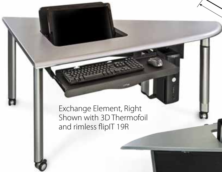
Exchange Element, Right Shown with 3D Thermofoil and rimless flipIT 19R