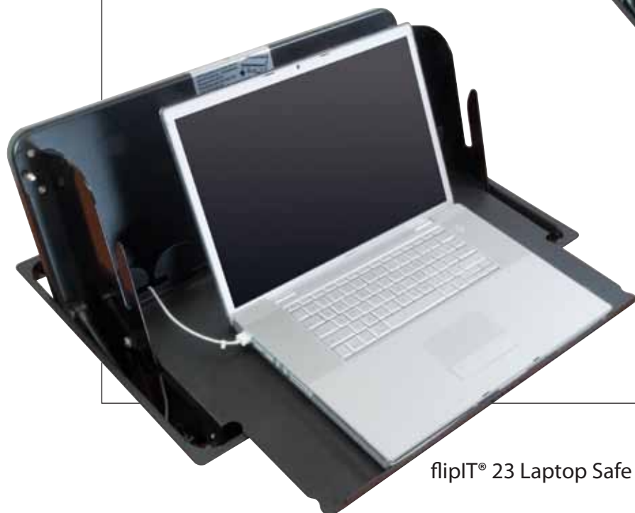
flipIT® 23 Laptop Safe

Universal wire management design allows cables to pass through for rear- and side-mounted power and data connections to laptop. Customized plate for specialized connections is available, optional.