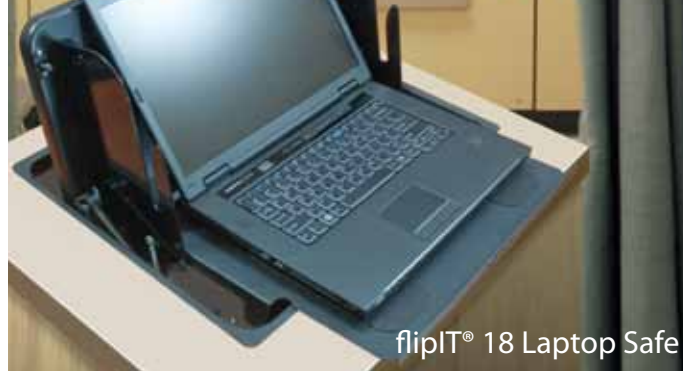
flipIT® 18 Laptop Safe

flipIT® Laptop Safe installs in any fixture Provides a locked storage chamber and a work surface when laptop is stowed.