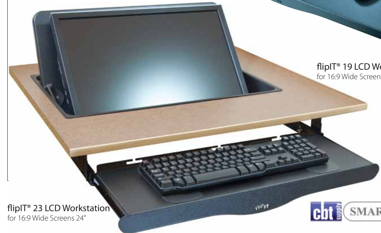
flipIT® 23 LCD Workstation for 16:9 Wide Screens 24"