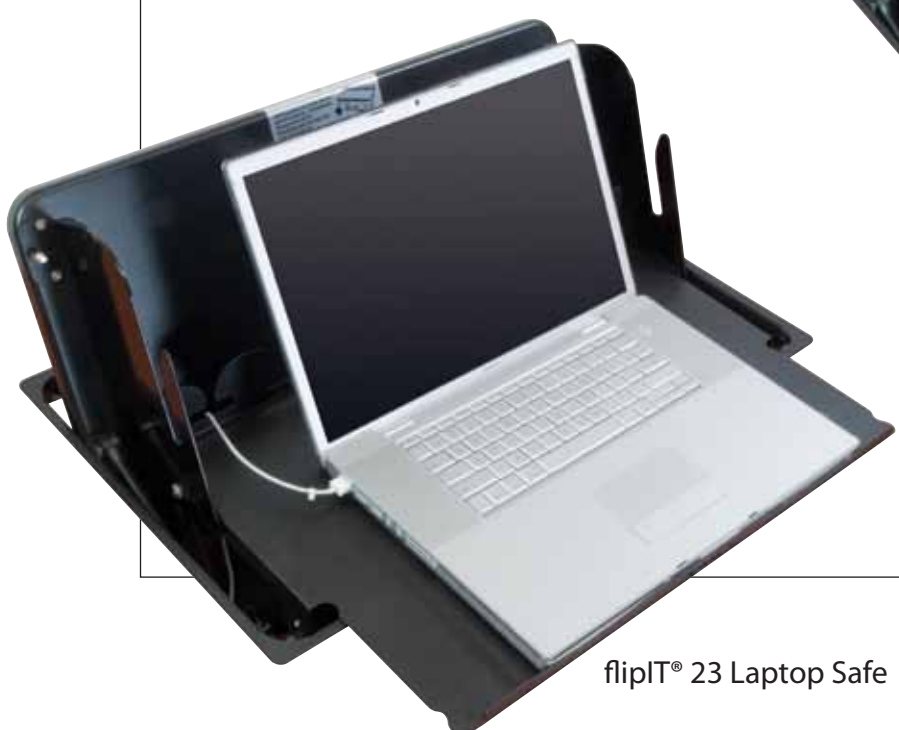
flipIT® 23 Laptop Safe

Universal wire management design allows cables to pass through for rear- and side-mounted power and data connections to laptop. Customized plate for specialized connections is available, optional.