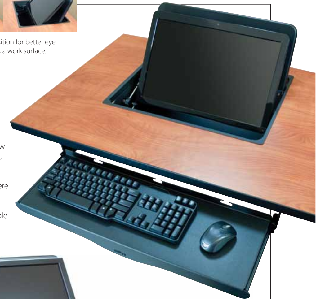
flipIT® 19 LCD Workstation for 16:9 Wide Screens 20"

Works great in conference room studios where cameras are used for teleconferencing. Data screens can now be placed in the personal spaces of participants, or flipped into the table top if not needed.