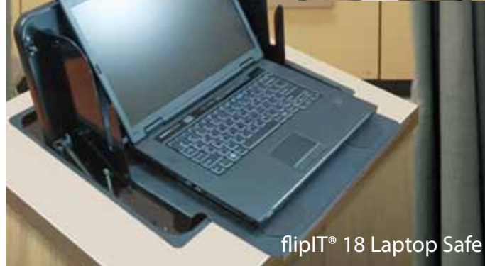
flipIT® 18 Laptop Safe