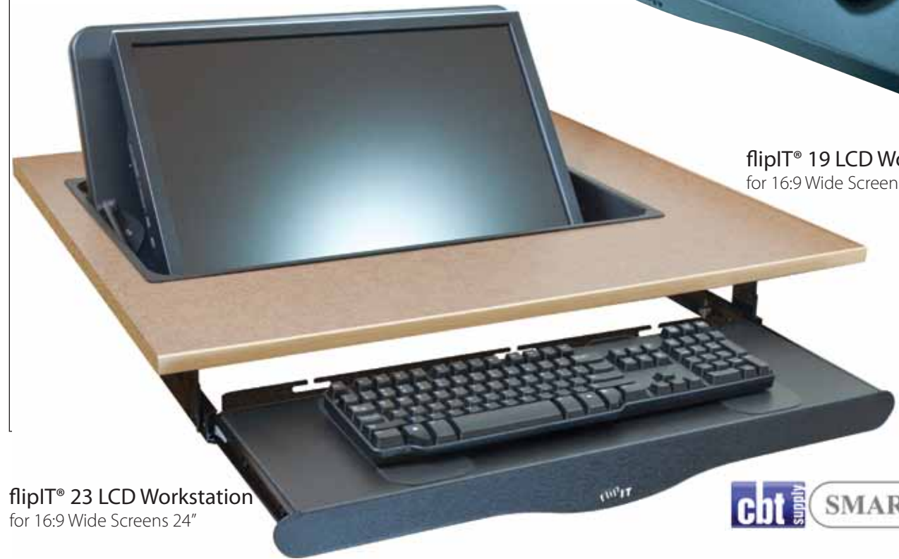
flipIT® 23 LCD Workstation for 16:9 Wide Screens 24"