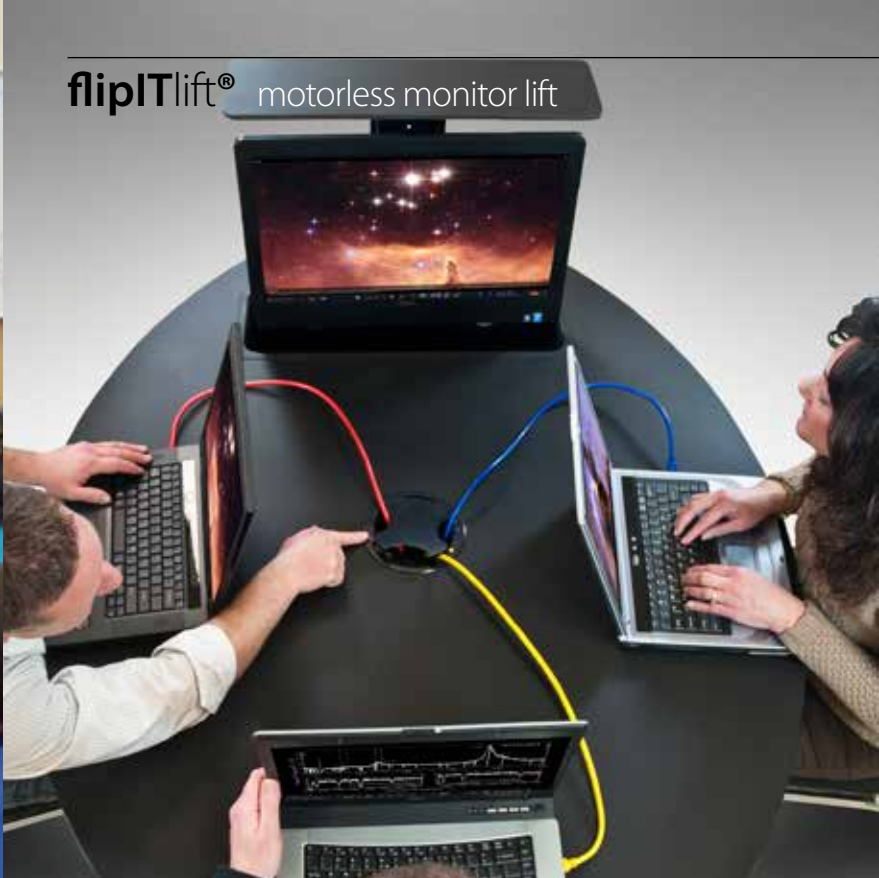
flipITlift® motorless monitor lift