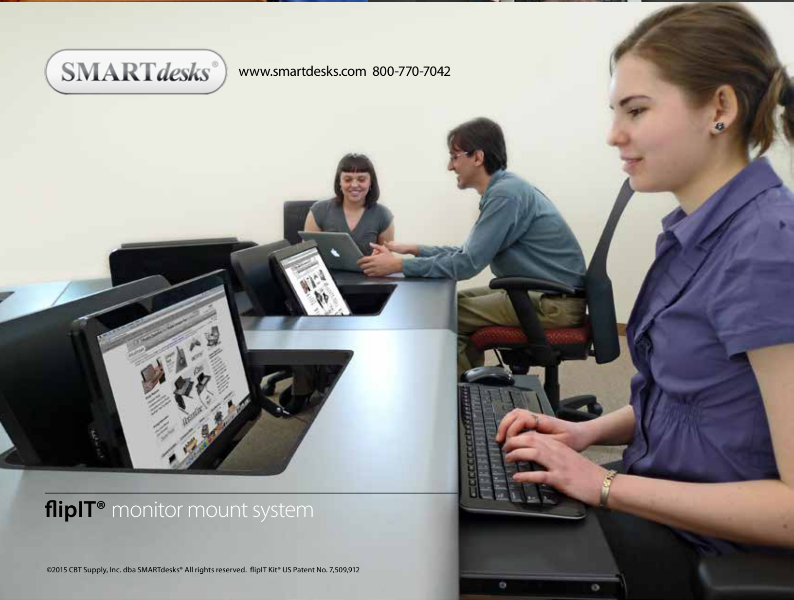
flipIT® monitor mount system