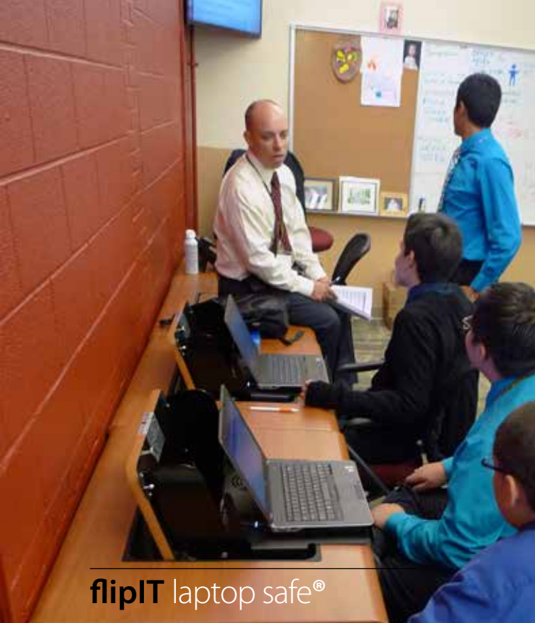
flipIT laptop safe®