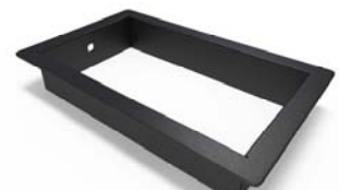
Villa Grommet No lid Black