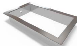
Villa Grommet No lid Stainless Steel