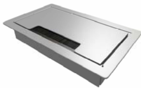
Villa Grommet with Flush Lid Silver Pearl

Villa Grommets are a stylish way to accessorize your work surface. Their modern design provides a simple, yet elegant solution for designers or manufacturers looking for a fresh alternative to traditional designs. Villa Grommets can be used alone or with one of our lid designs — Flush Style and Lift Style. The Flush Style comes equipped with a brush and sits flat within the work surface for a high end finish. The Lift Style provides a convenient recess to assist in opening of the lid. Both stay closed when in the vertical position for easy storage of tables. A variety of finishes are also available to compliment your work surface.