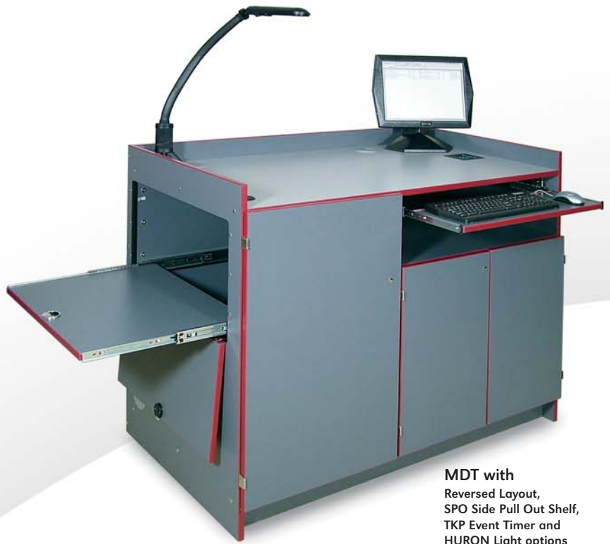
MDT with Reversed Layout, SPO Side Pull Out Shelf, TKP Event Timer and HURON Light options

Options for comfort, finish colors, security and connectivity abound to offer the ideal complement for your technology and presentation methods. The most complete and up-to-date offering is available online.