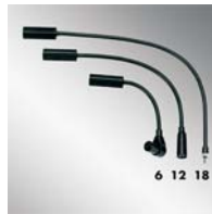
LLT Available 6, 12 & 18 in. with dimmer