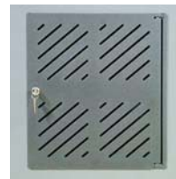
RAD Rear Access Door