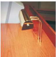
CLASSIC Solid Brass 40w Light