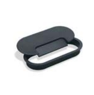
KKG "King Kong" Grommet 6" x 2.5"