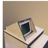
MC9 Monitor Cap for 19 in. CRT