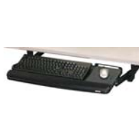
KD90 Ergonomic Keyboard Tray