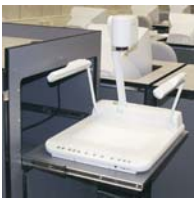
SPO Side Pull-Out doc cam or projector shelf