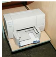
P2S Pull Out Access Shelf