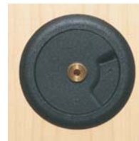
HSG Head Set Grommet