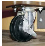
HDC Heavy Duty Casters