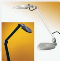
ECHO 50w Halogen Light