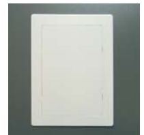
RAP Rear Access Panel