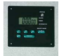
TKP Event Timer