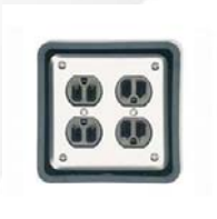
JB1 Fourplex Junction Box JB2 Duplex available