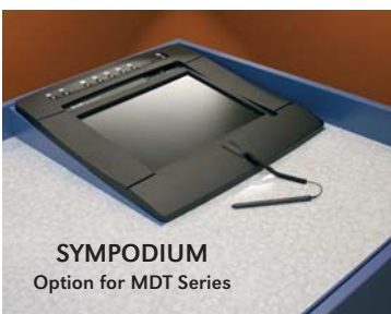
SYMPODIUM Option for MDT Series