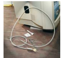
MCL Monitor Cable Lock