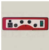
PCC Power Control Console