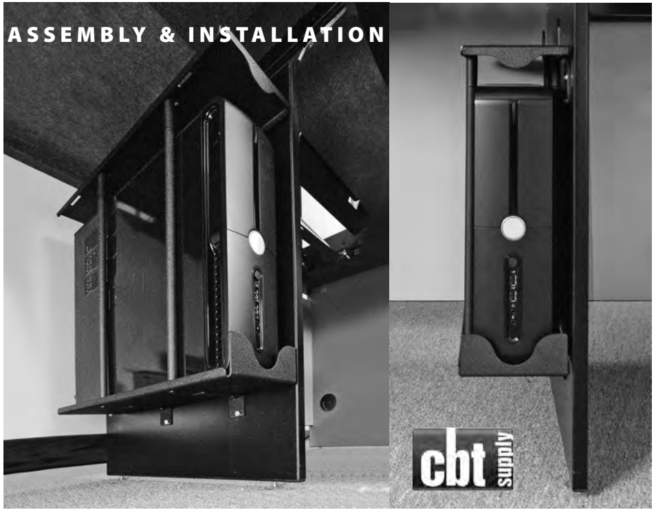
4 Carbon Steel Bars