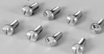
8 One Way Screws