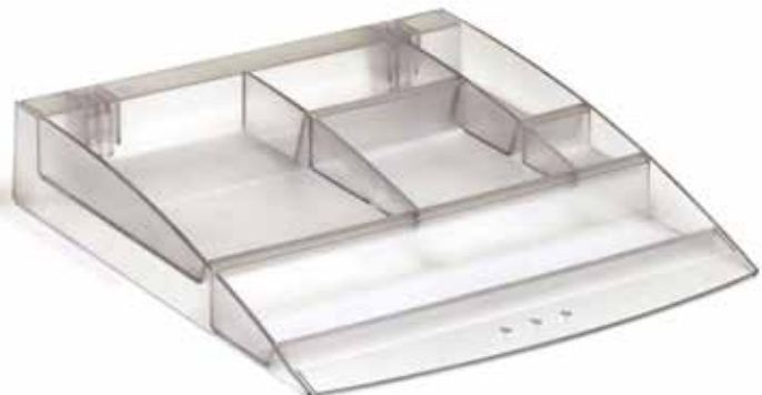
PPA-S-AT S Series Accessory Tray