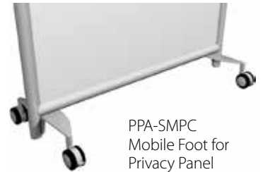
PPA-SMPC Mobile Foot for Privacy Panel