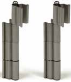
PPA-HGEU Universal Hinge Kit - set of 2