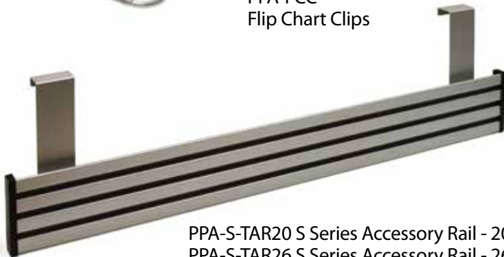
PPA-S-TAR20 S Series Accessory Rail - 20" PPA-S-TAR26 S Series Accessory Rail - 26" PPA-S-TAR32 S Series Accessory Rail - 32" PPA-S-TAR44 S Series Accessory Rail - 44"