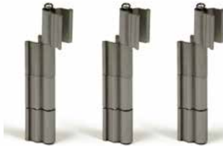
PPA-HGEUM Universal Hinge Kit - set of 3