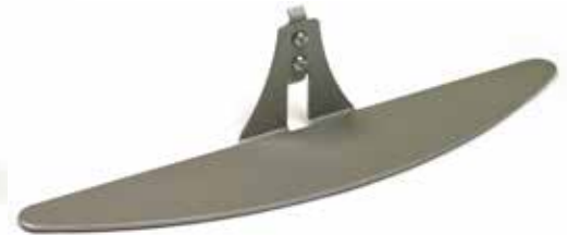
PPA-SMP Support Foot for Privacy Panel