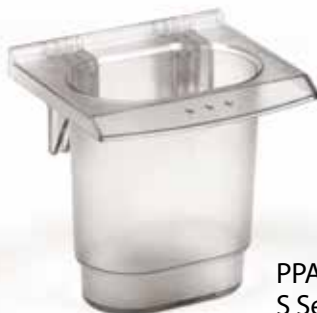
PPA-S-PC S Series Pen Cup