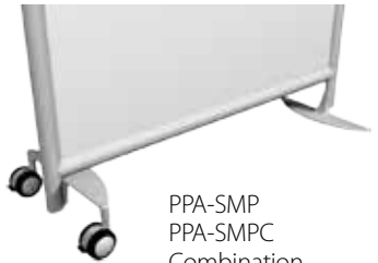
PPA-SMP PPA-SMPC Combination