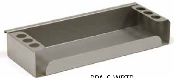
PPA-S-WBTR S Series Marker Tray