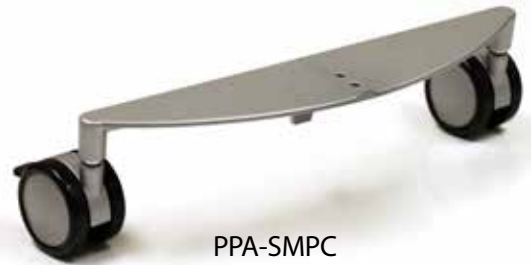
PPA-SMPC Mobile Foot for Privacy Panel