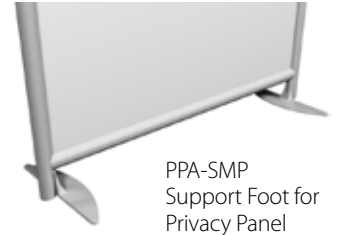
PPA-SMP Support Foot for Privacy Panel