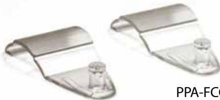
PPA-FCC Flip Chart Clips