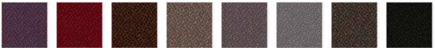
Amethyst Garnet Malt Manta Steel Iron Basalt Jet