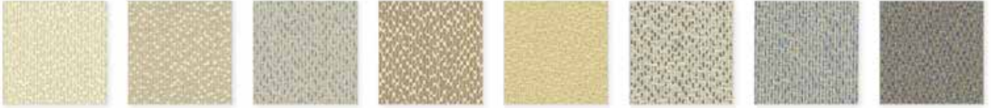
Creme Brulee Whitecap Mica Milkyway Wheat Seneca Cosmic Depth