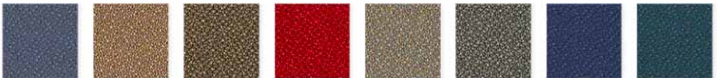
Sodalite Caraway Twine Fez Arundel Stately Sapphire Indigo